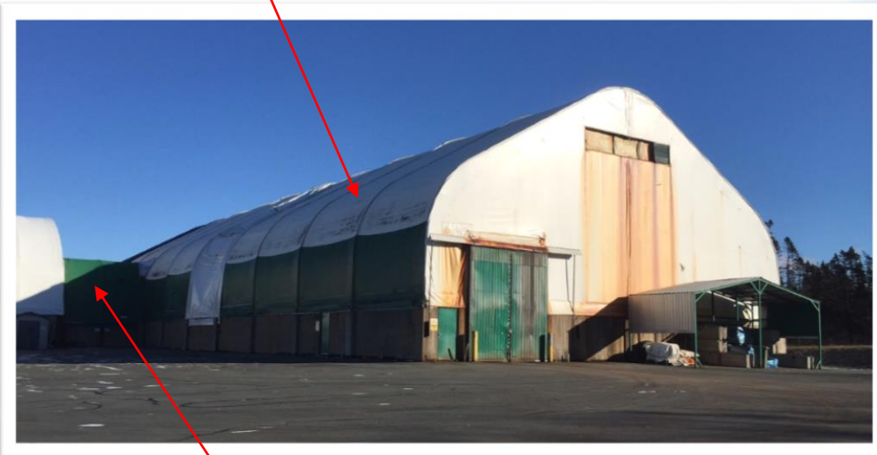
80' x 200' Screening Building