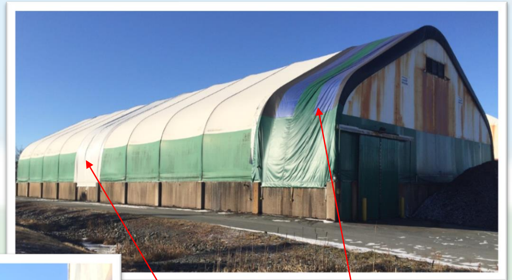
Fabric Patch (Jan 2018)